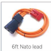
6ft Nato lead