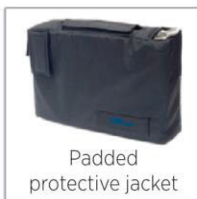
Padded protective jacket