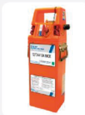
12/24V GA Pack