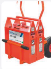
GPU 2400 Twin