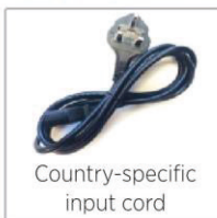
Country-specific input cord