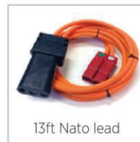
13ft Nato lead