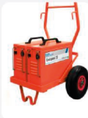
Coolspool 29 Twin