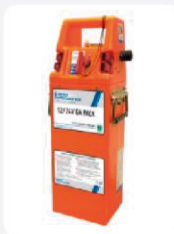
12/24V GA Pack