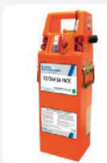
12/24V GA Pack