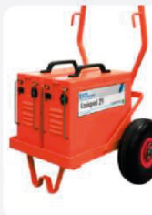
Coolspool 29 Twin