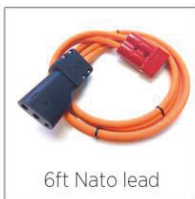
6ft Nato lead