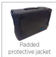
Padded protective jacket