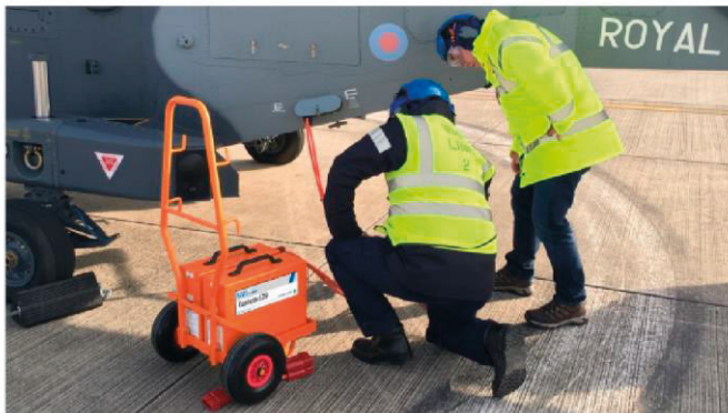
Coolspool 29 Twin: starting Lynx Wildcat