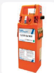
12/24V GA Pack