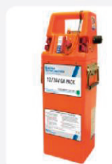
12/24 GA Pack