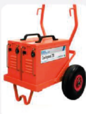
Coolspace 29 Twin