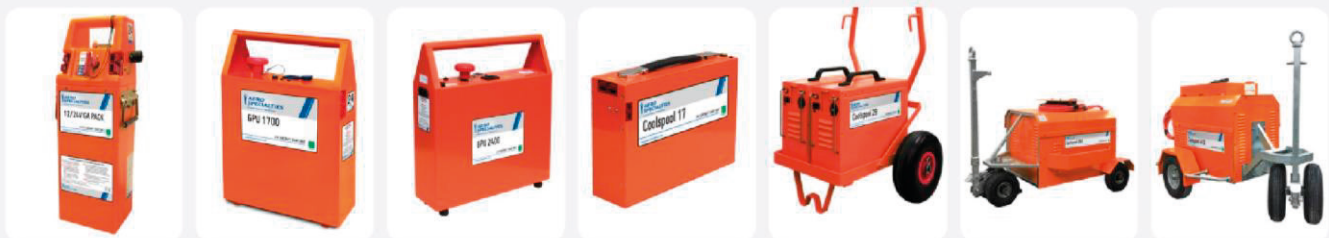
12/24 GA Pack