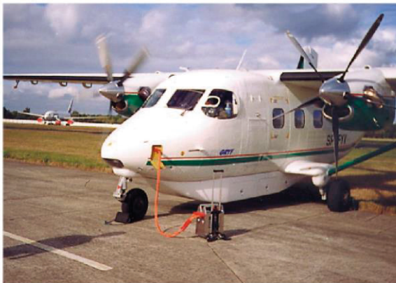
GPU 1700 Twin: PT6-67A start PZL Skytruck

** Peak amps is a theoretical calculation of the instantaneous current from a momentary dead short across the battery terminals. It is not representative of the power delivered at the aircraft plug due to cable losses and other factors. This figure is shown for comparative purposes.