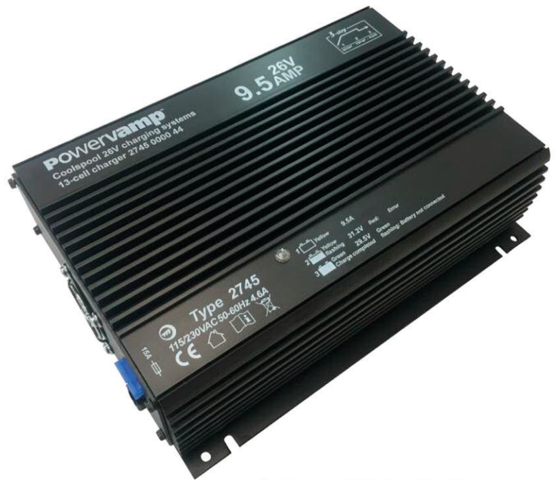
Model shown: 26V Coolspool Fast Charger

Each charger is also fitted with reverse polarity, short circuit protection and temperature controlled compensation, and has a wide input range for worldwide operation.